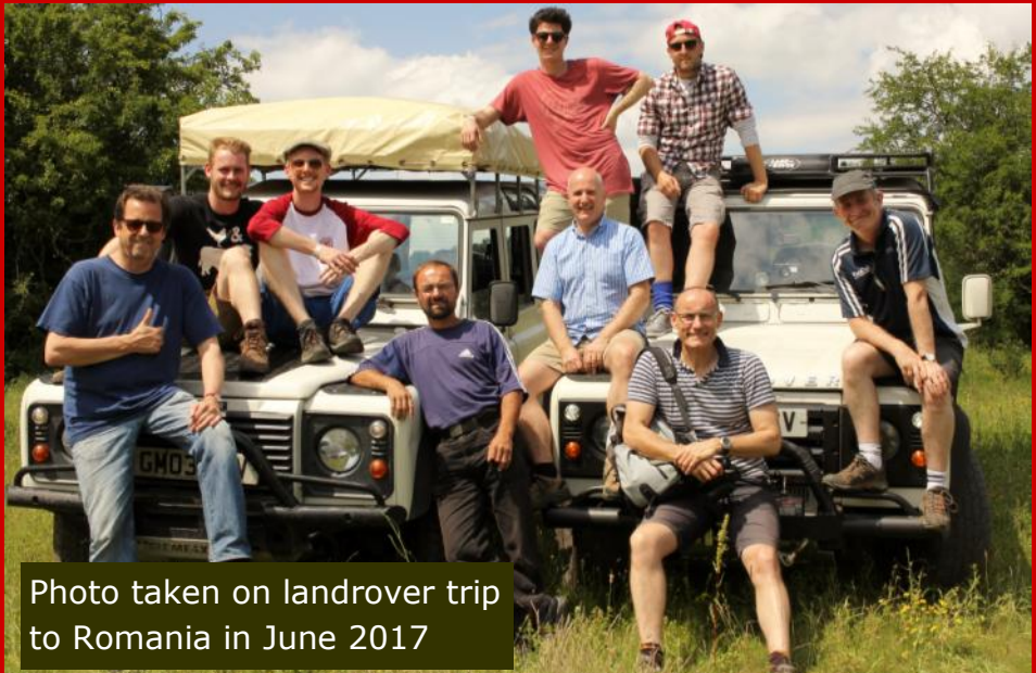
Photo taken on landrover trip to Romania in June 2017